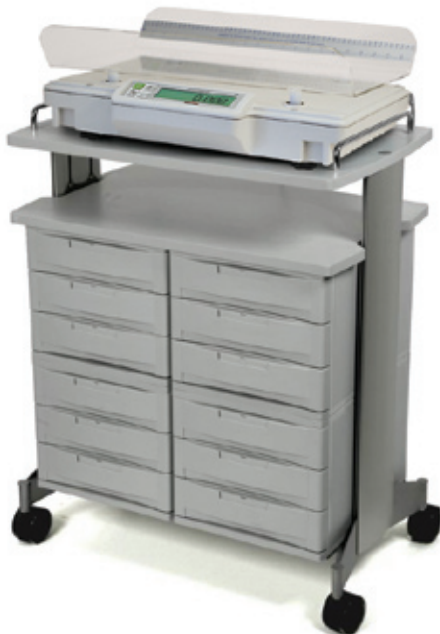
Cart not included.