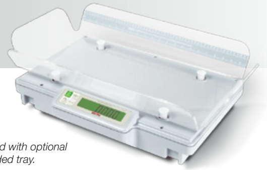
Pictured with optional four-sided tray.